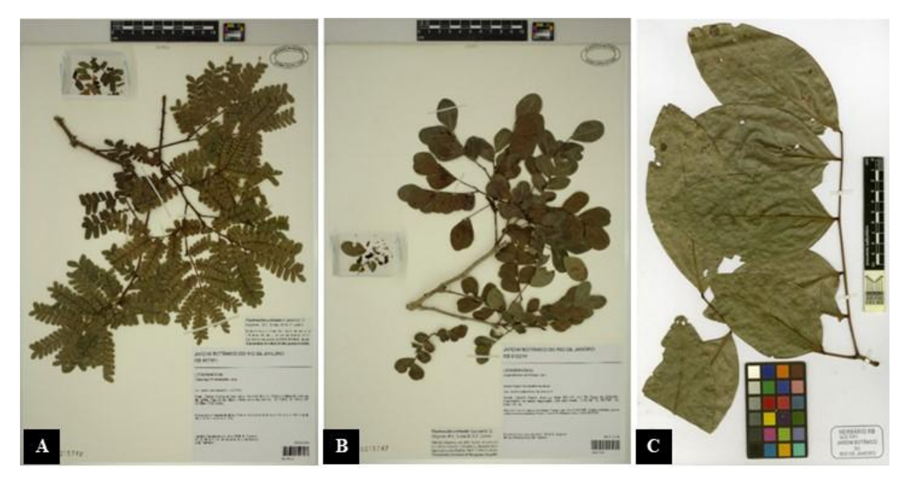
Figure 1 – Paubrasilia echinata morphotypes. A - Small-leaf or Arruda; B – Medium-sized-leaf or Coffee-leaf; C - Large-leaf variant or Orange-leaf. Images from Rees et al (2023).